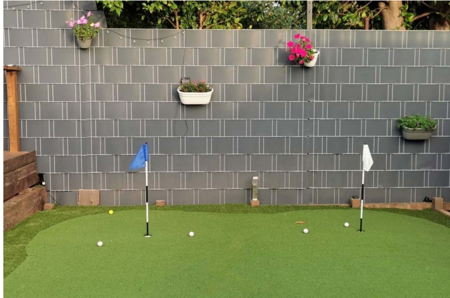
RAMPART 280 DOUBLE WIRE Privacy inserts mimic the effect of a brick wall, creating an inviting enclosure at just a fraction of the price.