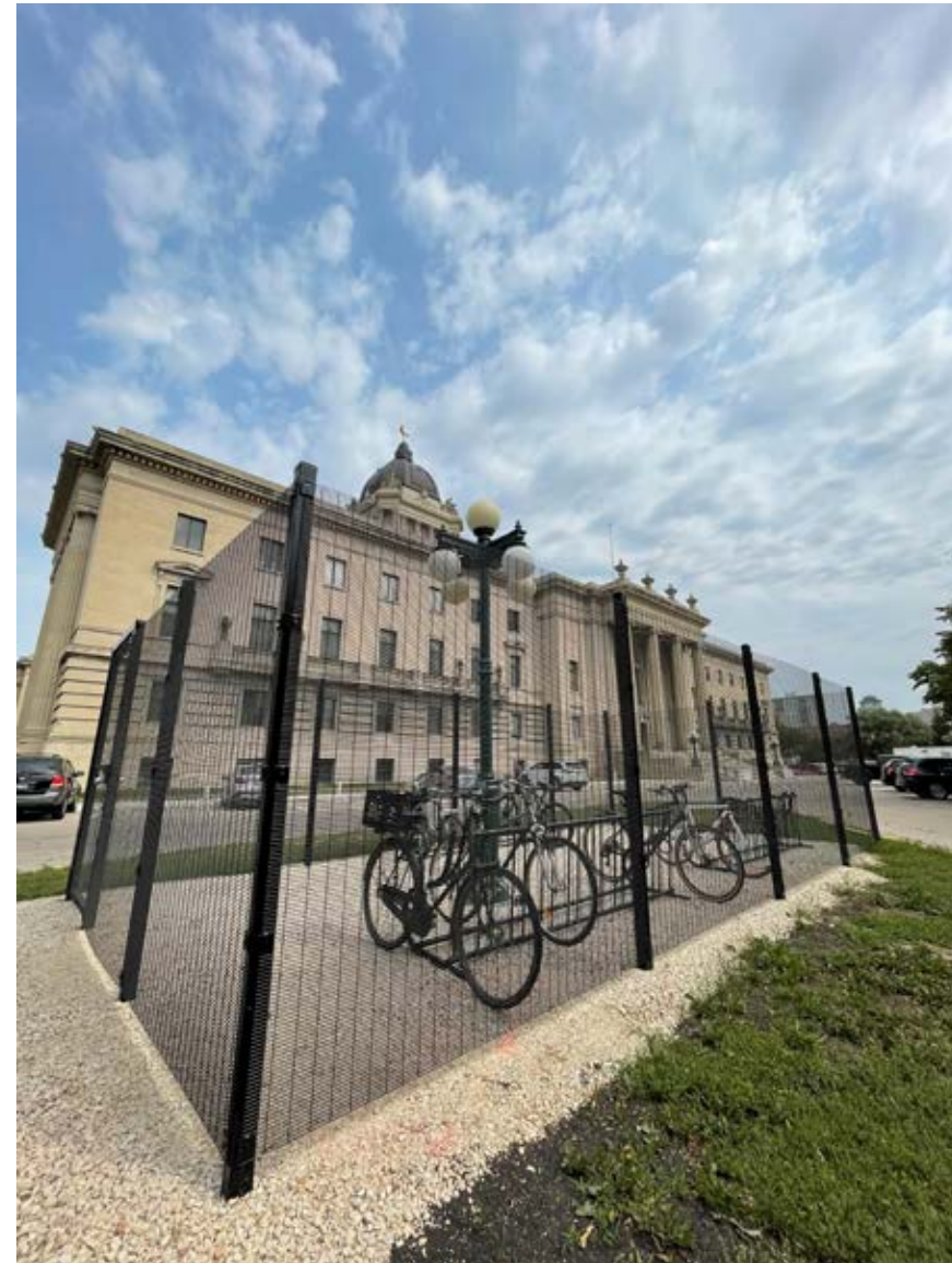
RAMPART 358 SECURITY Panels are versatile enough to address a range of enclosure needs. Their wire construction ensures security, all while seamlessly blending with the natural beauty of the surroundings.