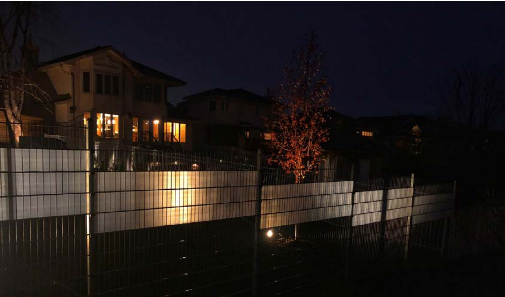
PRIVACY INSERTS Using privacy and lighting as design elements brings a unique look to any landscape.